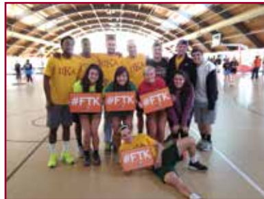
Gamma Chi brothers at Dance Marathon, an event that benefits Children's Miracle Network hospitals.